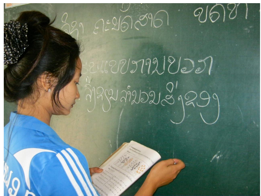
Young Lao woman at school. Today, Lao women and girls have more opportunities to attend school and pursue occupations outside of the home.