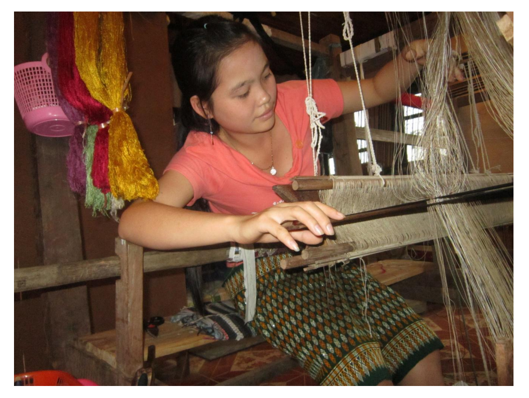
A young Lao women practicing traditional weaving techniques. Young Lao women learn to weave from elders in their family and community.