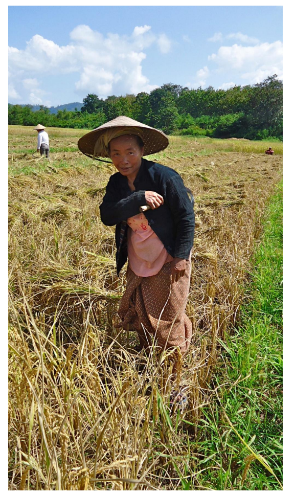
Lao woman harvesting rice.